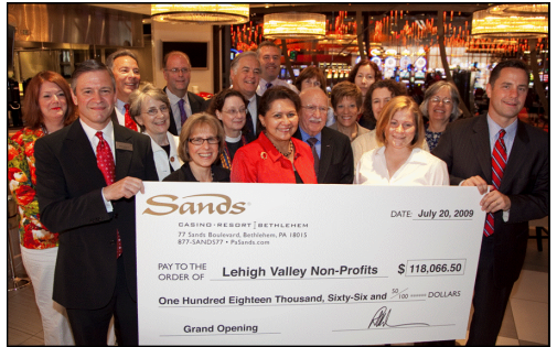
Nonprofits receive funds from Sands test days

Grand opening of casino, Emeril's Chophouse and St. James Gate pub (May); Initial hiring of 1,000 employees; slots expansion, Carnegie Deli and Burgers and More open (November). 2010 Projection: Table games (summer); additional 500 employees expected