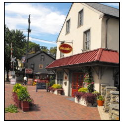
New Hope, PA

Researched grant opportunities; Prepared Catalytic Projects Report to assist with the revitalization efforts in the Landmark Towns of Bucks County, PA (the Boroughs of New Hope, Morrisville, Yardley and Bristol)